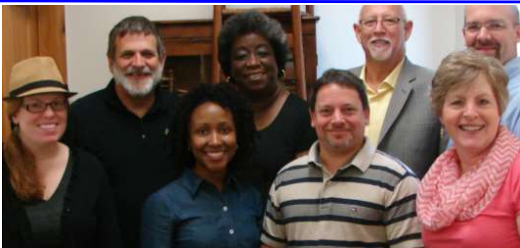
Some 2014 LCA Committee Chairs at recent Board Meeting.

Look forward to seeing you all at the LCA conference in New Orleans. Until then remember that we are “Mejor Juntos” – Better Together! 😊